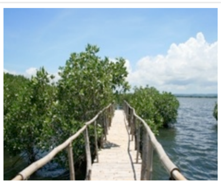
Bamboo walkway at the Bangrin MPA, Bangrin, Pangasinan

The exercise allowed the MPA site managers to apply coarse criteria to assess the applicability PES in their respective areas. The results of the breakout group discussions indicate that there is a common tendency to want to apply PES perhaps due to its allure as a sustainable financing tool and its attractiveness to compensate groups/communities who are tasked with coastal management. Several things need to be stressed, though.