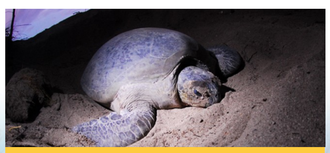
Getting ready to hatch, a turtle digs its nest in the Turtle Islands.

The Turtle Islands Wildlife Sanctuary is regarded as the only major nesting ground of the green turtle (Chelonia mydas) in the whole ASEAN region, with more than 1,000 nesters annually. Turtle Islands is part of the Sulu Archipelago, which consists of six islands, namely: Boan, Lihiman,